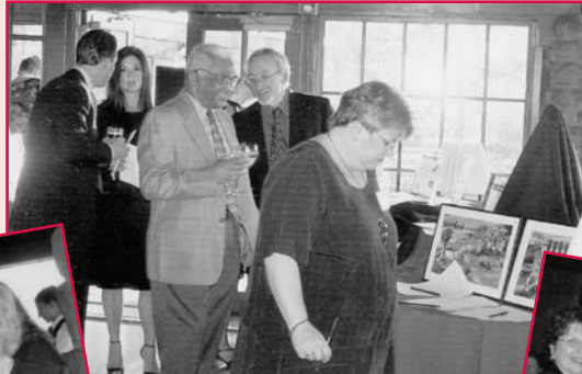
A festive atmosphere surrounded the bidding.