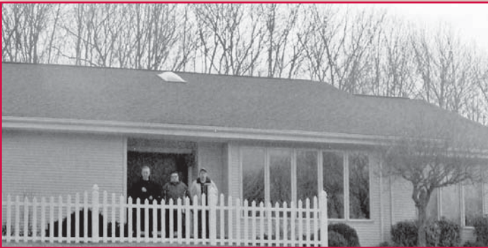
Woods Circle Group Home