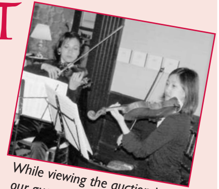
While viewing the auction items, our guests enjoyed listening to a violin duo.