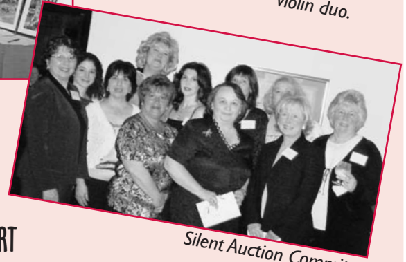
Silent Auction Committee

Having a Fantastic Time at HART Dinner Dance and Silent Auction